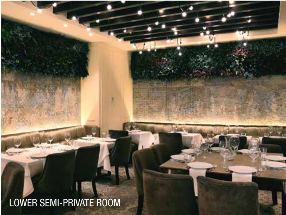
LOWER SEMI-PRIVATE ROOM