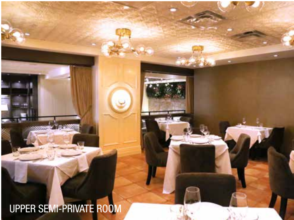
UPPER SEMI-PRIVATE ROOM