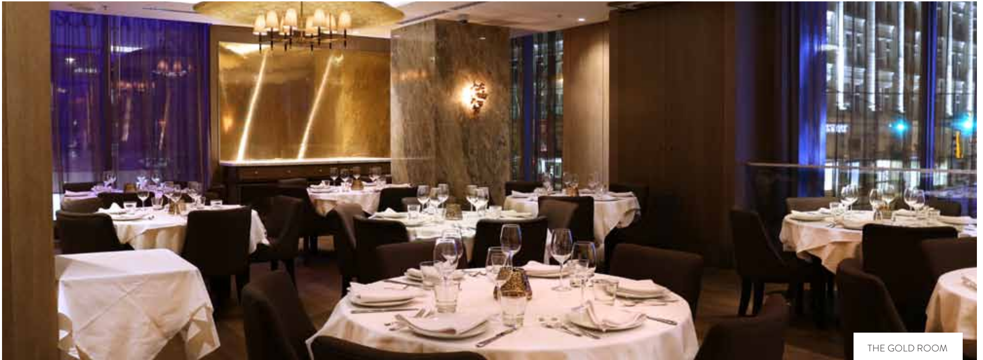
THE GOLD ROOM