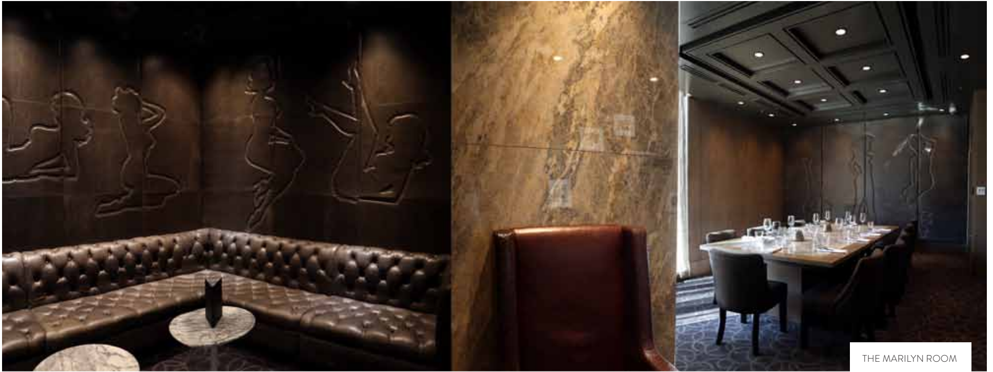
THE MARILYN ROOM