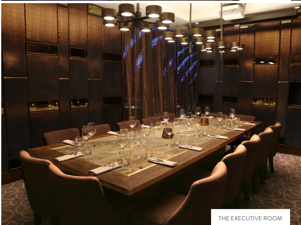
THE EXECUTIVE ROOM