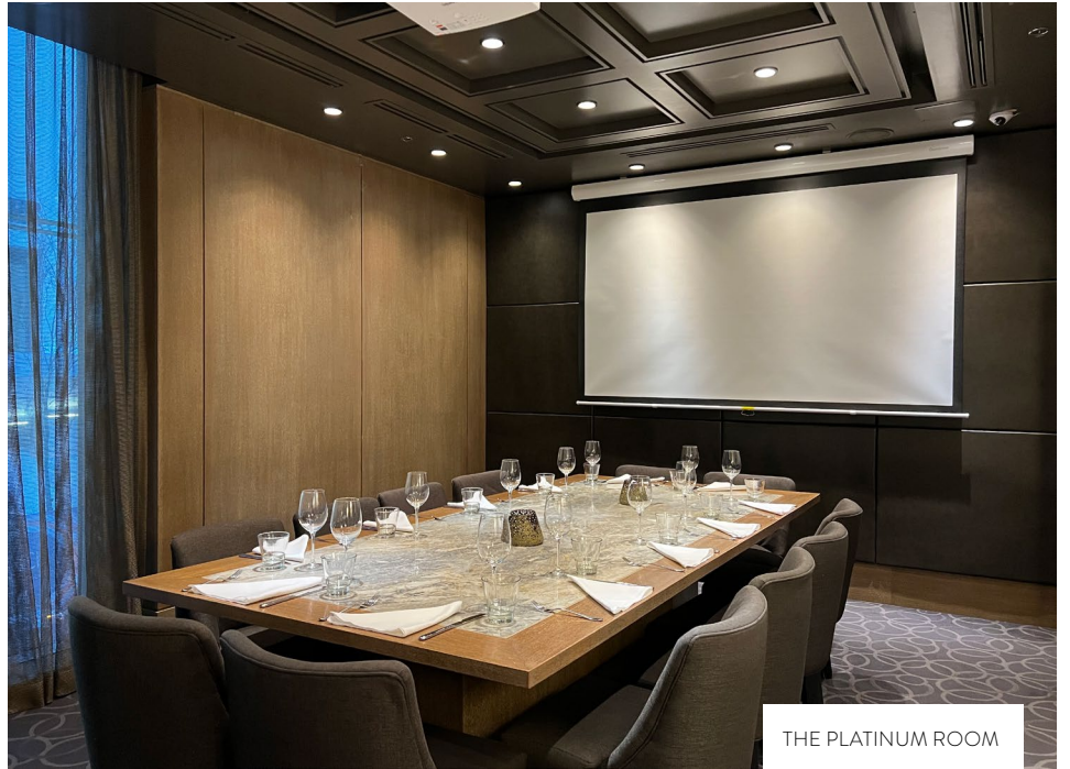
THE PLATINUM ROOM