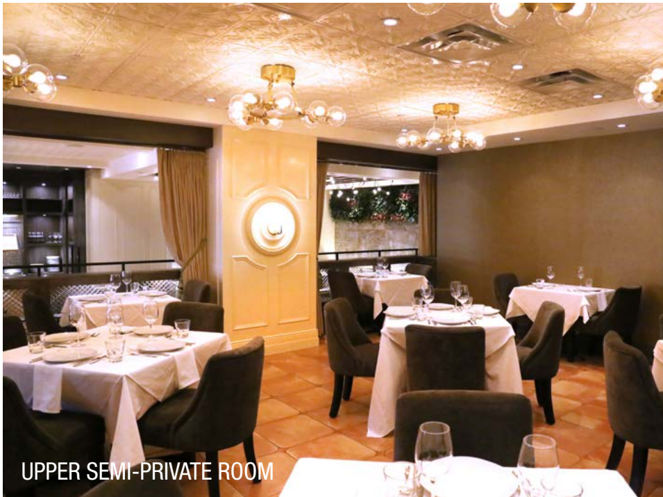
UPPER SEMI-PRIVATE ROOM