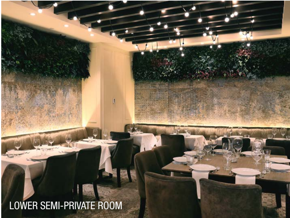
LOWER SEMI-PRIVATE ROOM