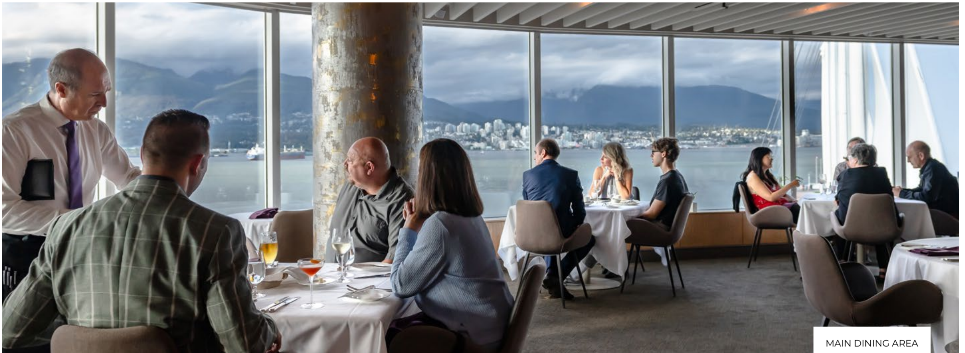
MAIN DINING AREA