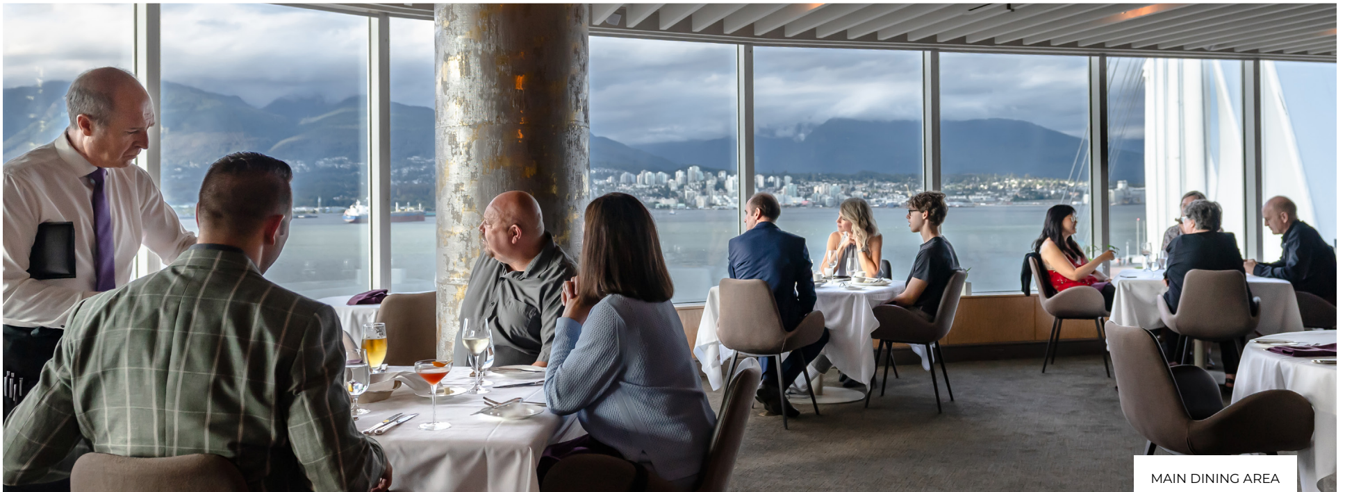
MAIN DINING AREA