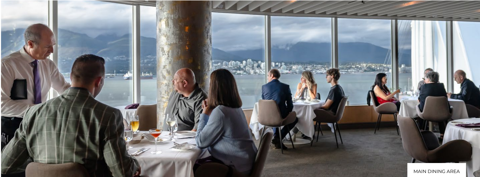
MAIN DINING AREA