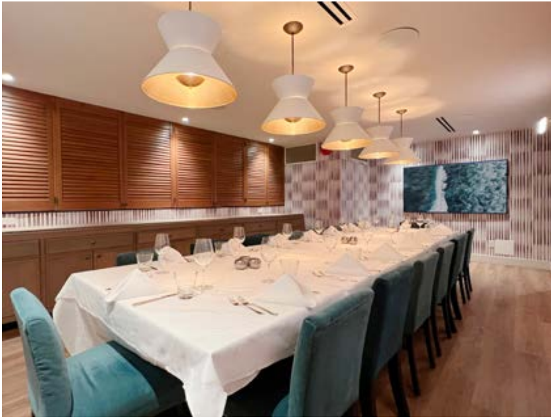
THE STARBOARD ROOM