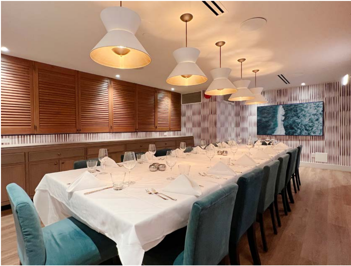
THE STARBOARD ROOM