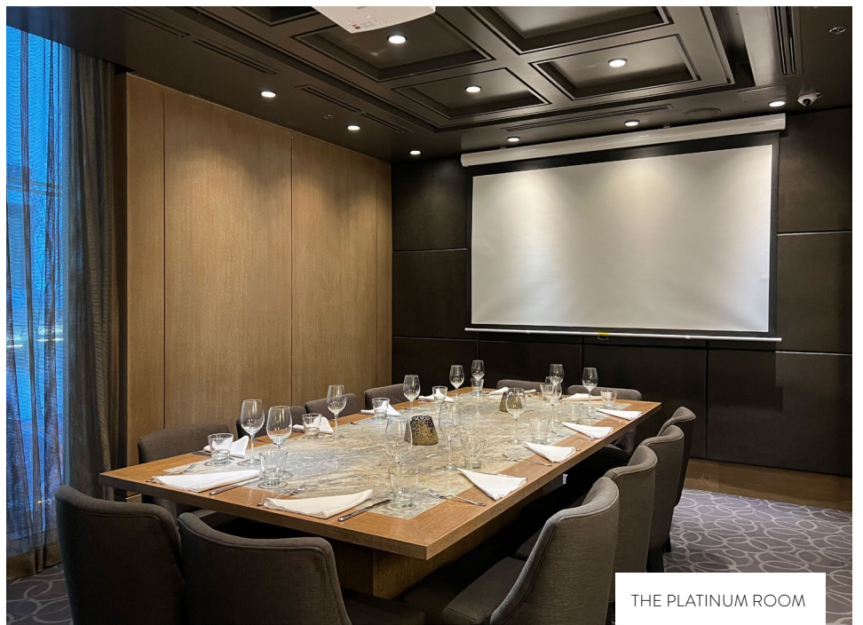
THE PLATINUM ROOM