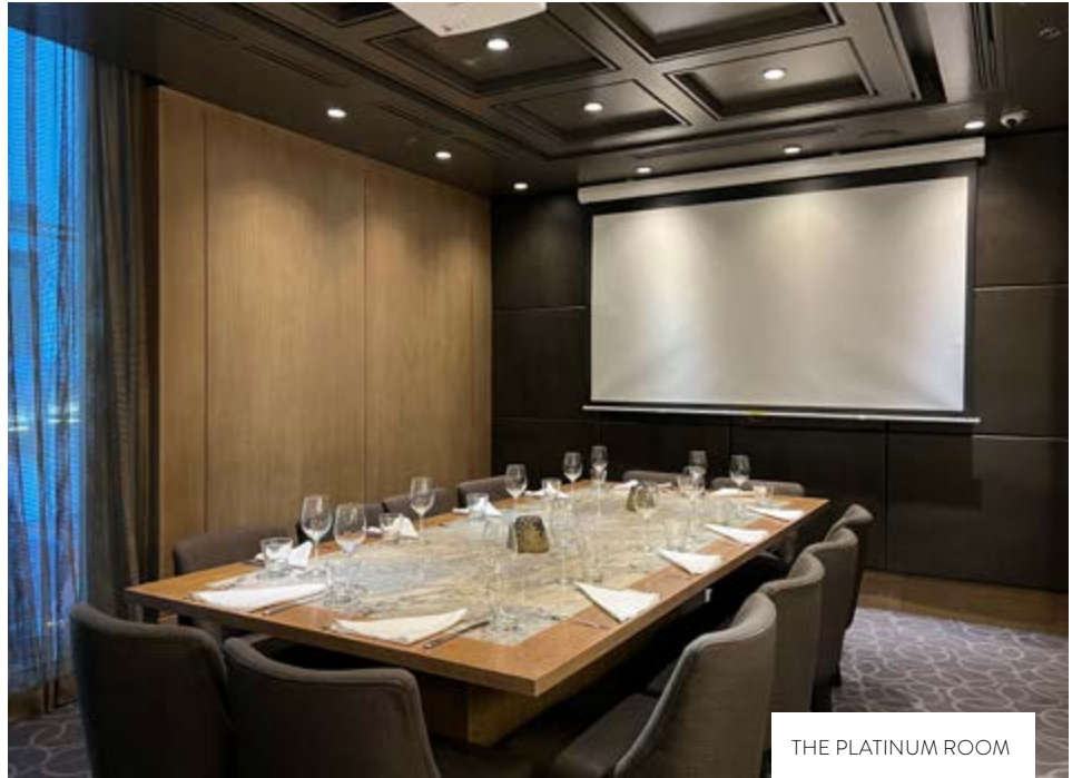
THE PLATINUM ROOM