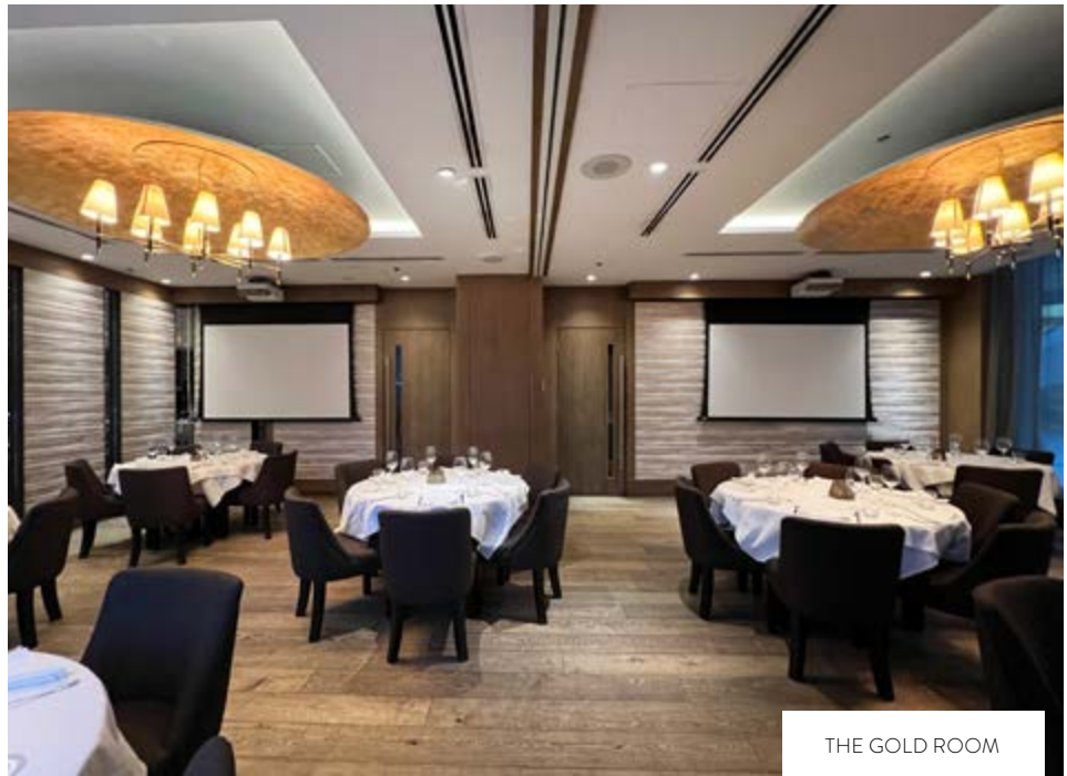
THE GOLD ROOM