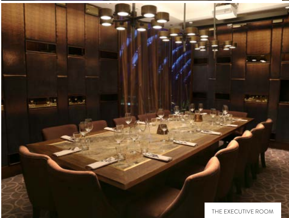
THE EXECUTIVE ROOM