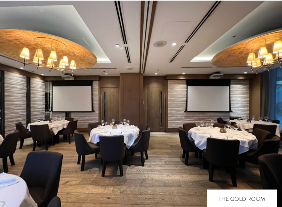
THE GOLD ROOM