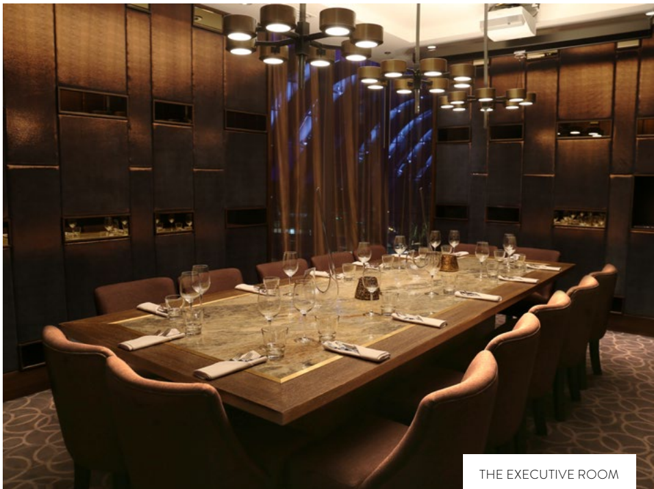
THE EXECUTIVE ROOM