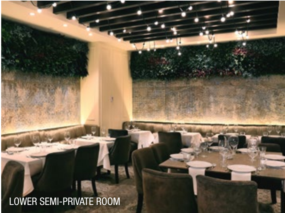
LOWER SEMI-PRIVATE ROOM